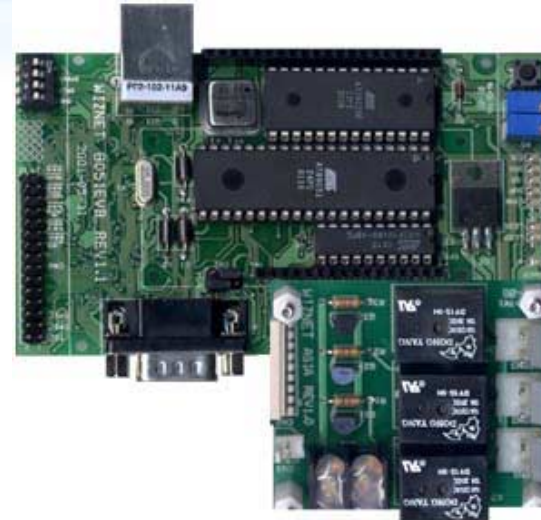
Remote Controller Module